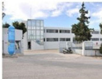
Warehouse in Heraklion - Crete