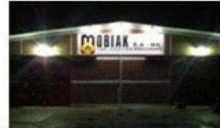
MOBIAK Balkans Branch (F.Y.R.O.M)