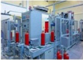
Automatic Production Line