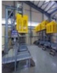
Gas Bottling Unit