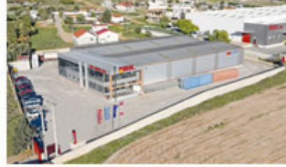
Warehouse in Athens - Greece