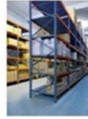
Warehouse in Crete