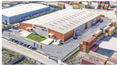
Warehouse in Thessaloniki - Greece